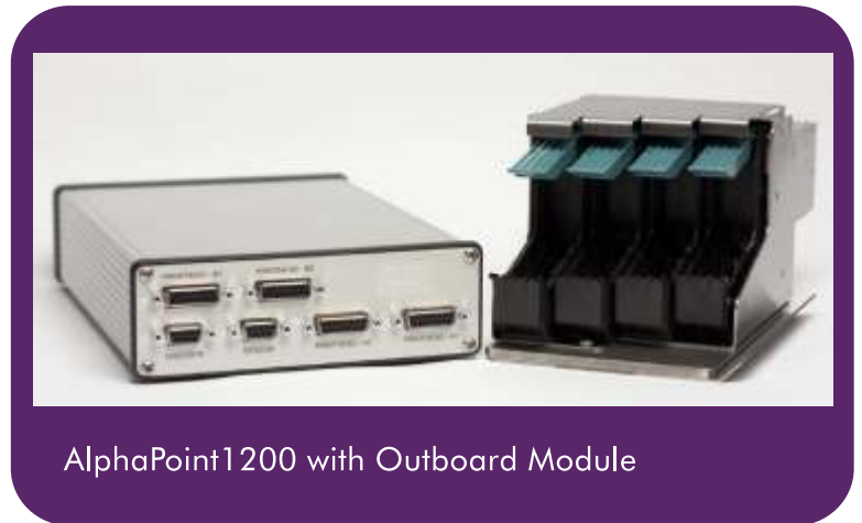
AlphaPoint1200 with Outboard Module